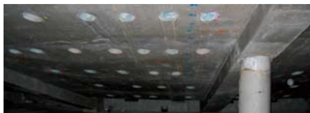
Under floor air supply holes

Despite overcoming the challenges of space and installation, Stevenson cites the control strategy of the displacement system as one of the most important components of the project.