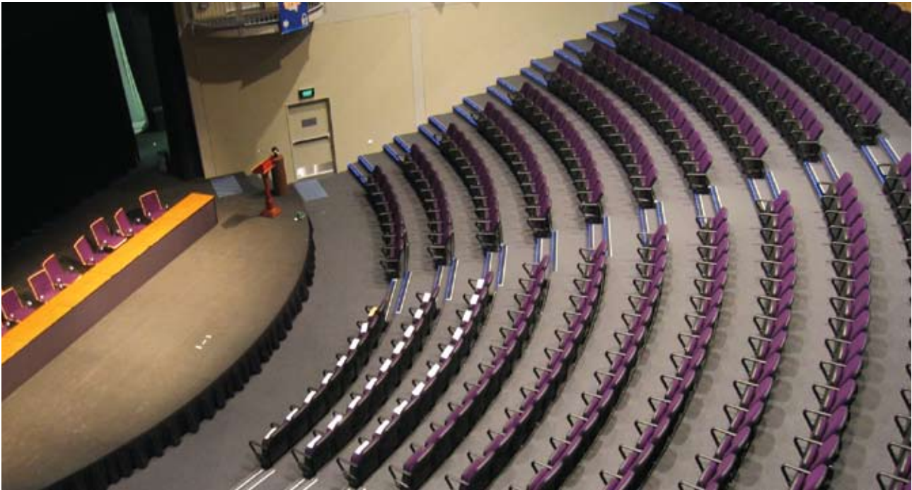
Inside the performing arts centre

“We also included a ‘free reheat’ option which diverts heat that would ordinarily be rejected to the atmosphere, to a two stage reheat coil, allowing for precise control of supply air temperature and humidity – a major design requirement for the air handling plant.”